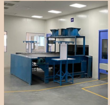
Screen Print & Lehr