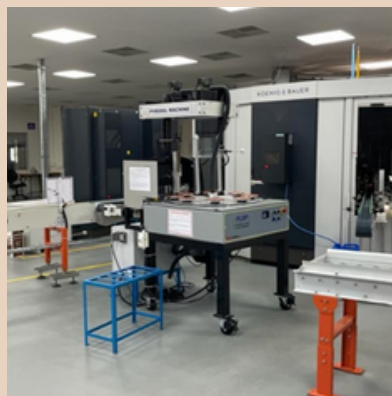
Pyrosil Unit - Screen Print Line